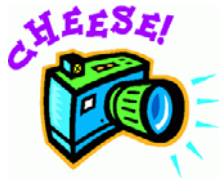
Photo retakes will take place on October 26 th in the morning. Please mark this date on your calendar.

Please return your child's picture form indicating that you would like your child to have picture retakes.